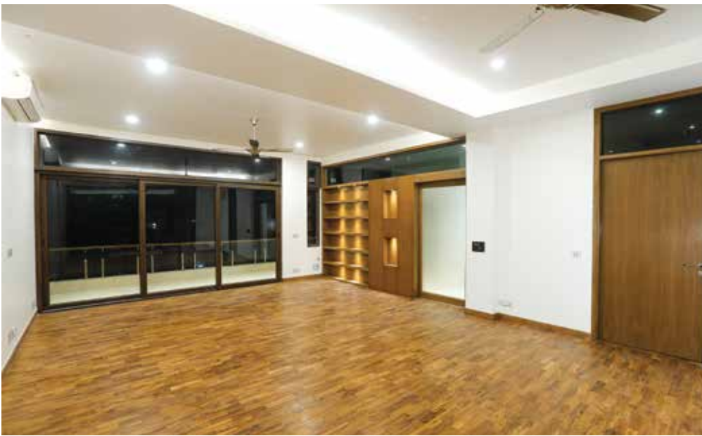
Live in Style in this King Size Master Suite

With a walk-in closet-cum-dressing room (lower left) and a plush bathroom (lower right)