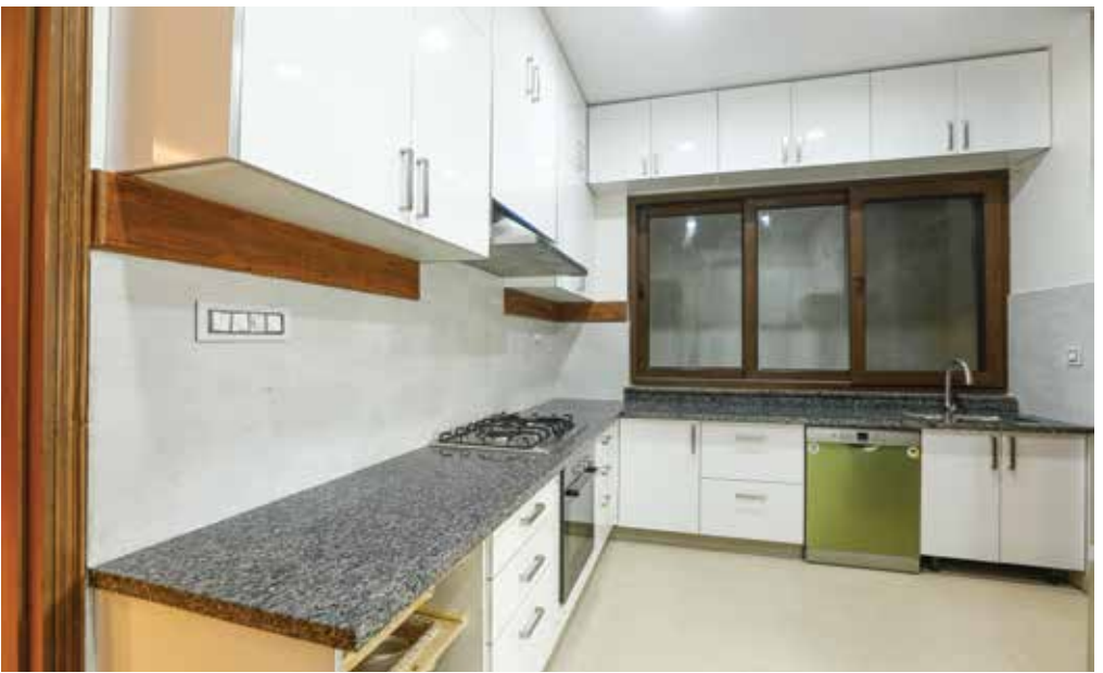
Prepare Epicurean Meals in the Comfortable, Fully-Equipped Kitchen

Leading on to a Utility Area with living space for domestic help (pic lower right)